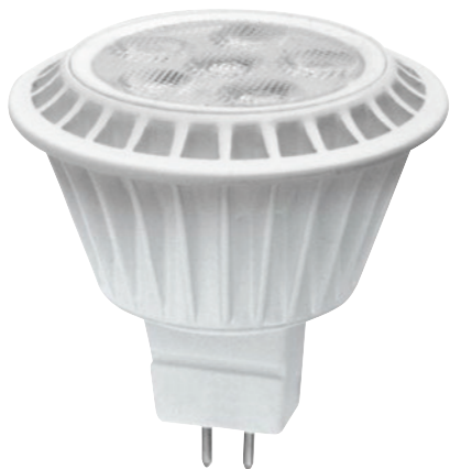
7W 12V MR16