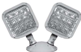
INDOOR REMOTE HEADS