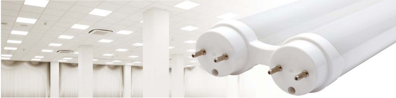
Application illustration only, subject lamps not used in photo.