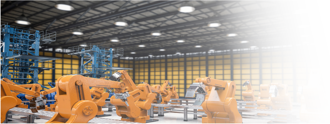
Application illustration only, subject lamps not used in photo.