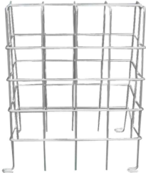
ELA WGEXE (11"H x 15"W x 4-3/4"D) (discontinued)

See Compatibility And Ordering Information next page.