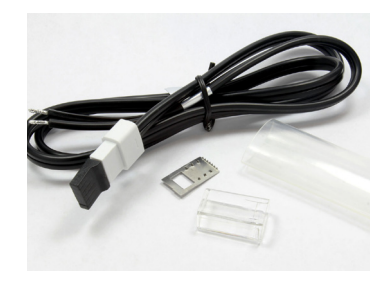
Power Feed Kit