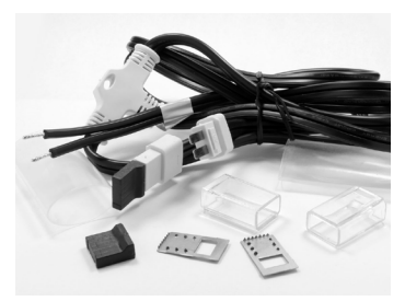
"T" Power Feed Connector Kit