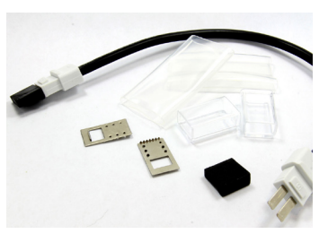
Jumper Connector Kit

Part # - 0 35127 47753 4 Only works with Gen 2 Channel models