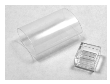
End Cap Kit