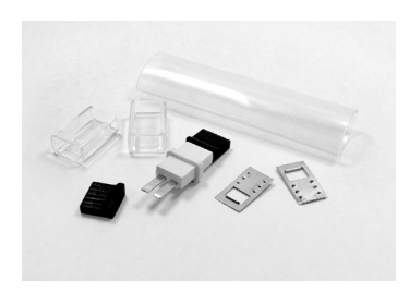
Double-Sided Connector Kit