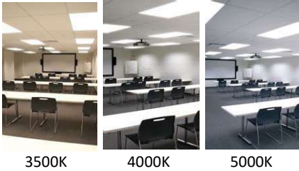
3500K 4000K 5000K