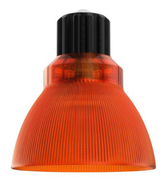
ORTP Fluo Orange